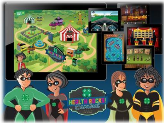
4-H Health Rocks! Carnival Game

The 4-H Yearbook can help you navigate the 4-H year. For your convenience we have published the yearbook at https://tiny.utk.edu/4hyearbook . Go ahead and take a look. We will review the yearbook in your 4-H club meeting this month.